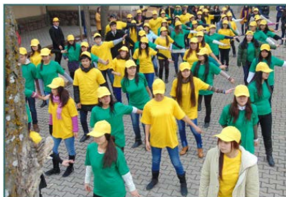
Environmental flash mob