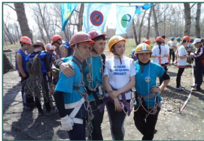
Tourist all-around competition