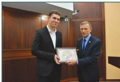
Scientific conference winner