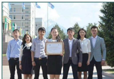
International Scientific Conference Winners