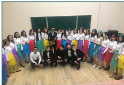
Competition for the best student group

There are student self-governments at the faculty, such as student council, student maslikhat and student trade union organization "Sunkar". Nonresident students are provided with a hostel.